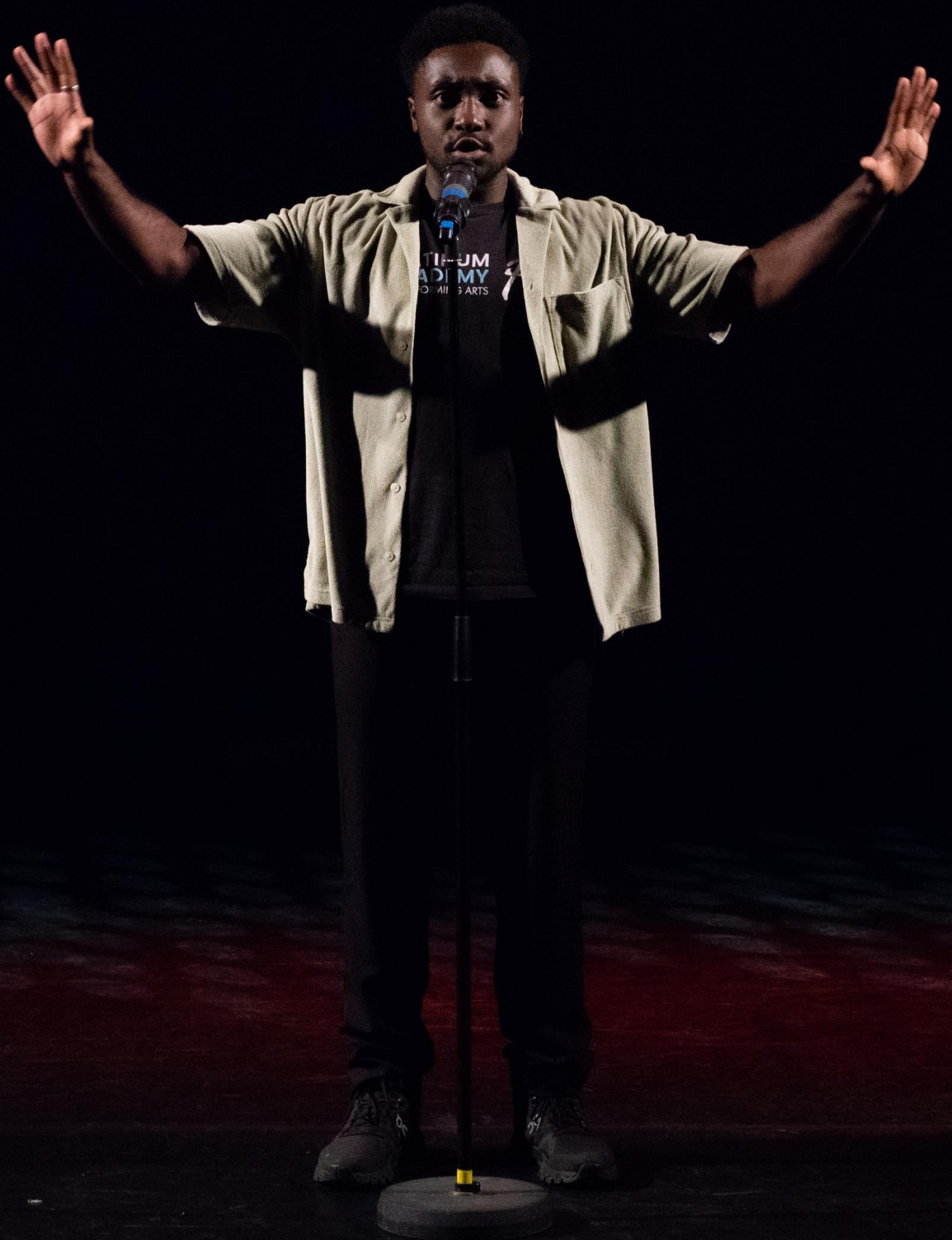
Young people's performance from Platinum Arts