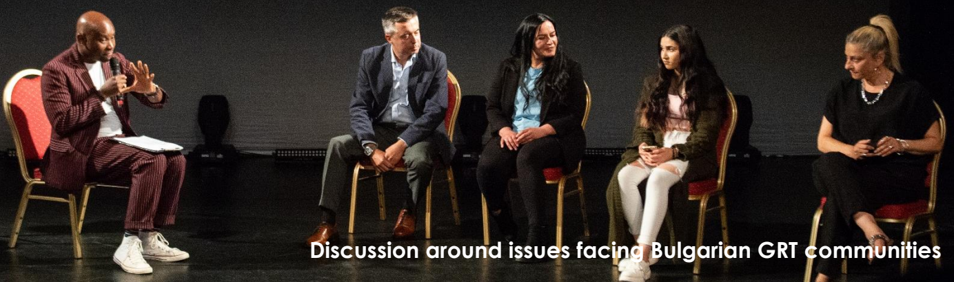
Discussion around issues facing Bulgarian GRT communities

“Healthy behaviours and lifestyles of our population are critical to improving outcomes, but without a new relationship with our communities this cannot be achieved.”