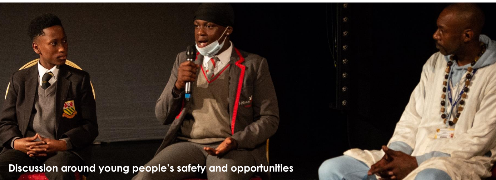
Discussion around young people's safety and opportunities