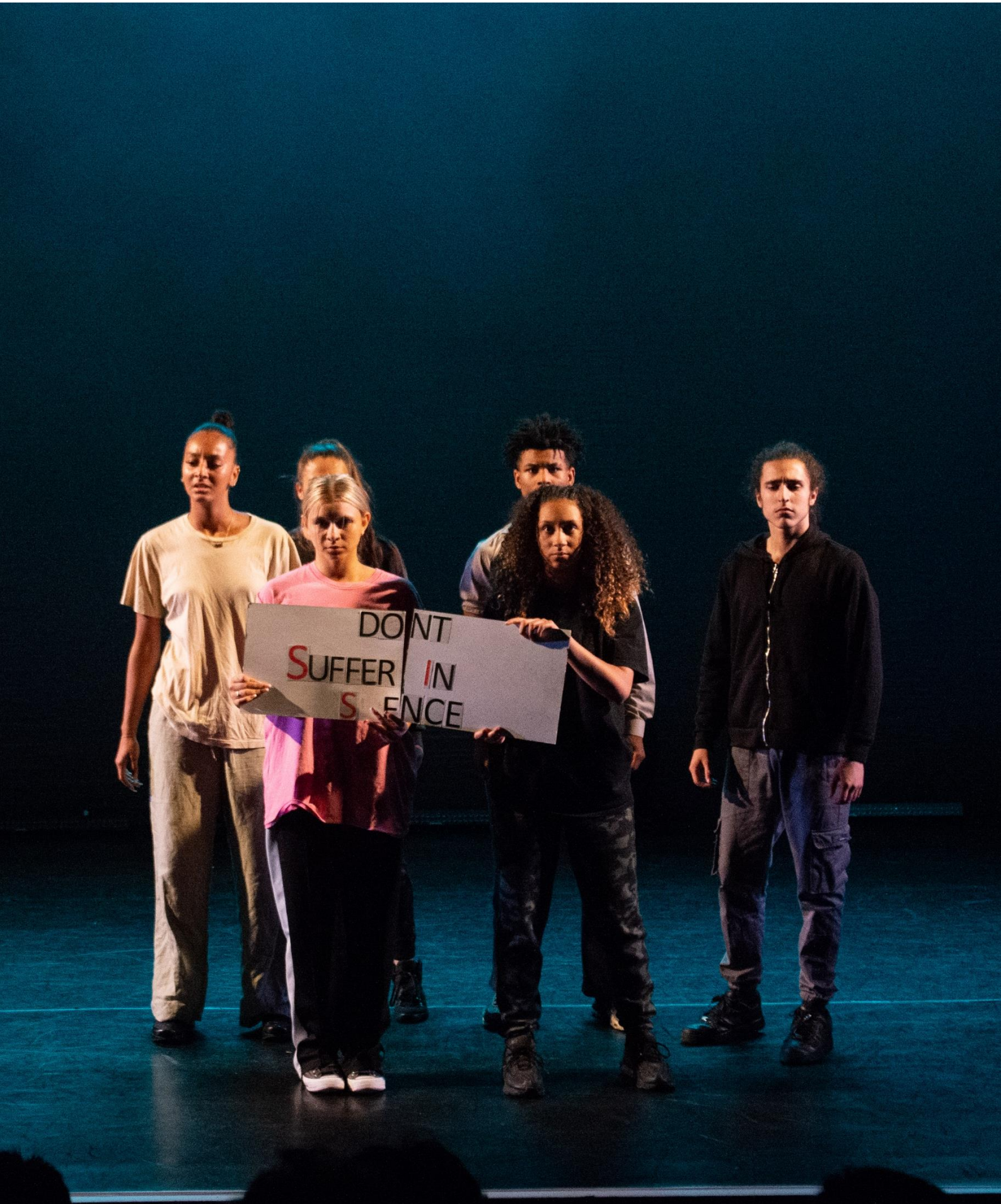
Young people's performance from Platinum Arts