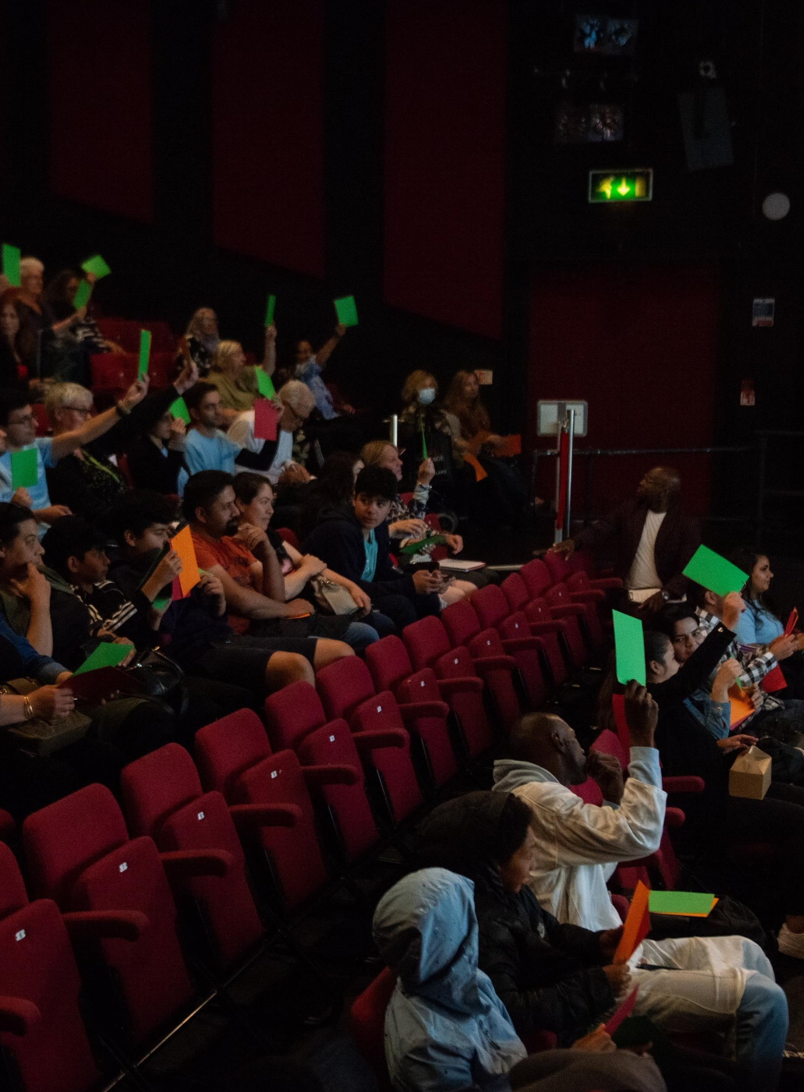
How do you feel about...? Red/amber/green voting at showcase event